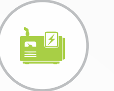
Genset 20 KVA